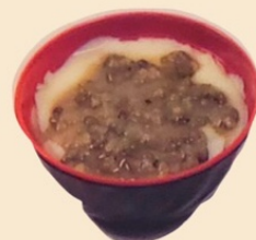
GREEN BEAN 綠豆豆腐花