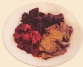
3 VEGETARIAN GLUTEN 三色齋