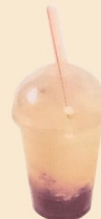
SOYMILK + RED BEAN + SOY PUDDING 紅豆豆花豆漿