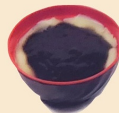
SESAME PASTE 黑芝麻豆腐花