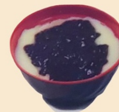
BLACK SWEET RICE 黑糯米豆腐花