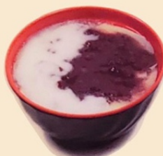
RED BEAN + COCONUT MILK 紅豆椰汁豆腐花