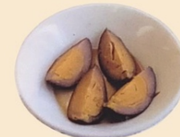
MARINATED EGG 滷水蛋