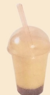
SOYMILK + BASIL SEED 青蛙蛋豆漿