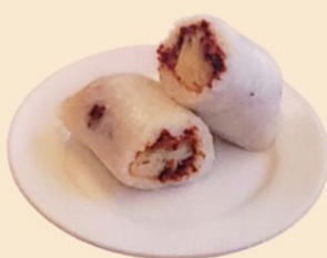
STICKY RICE ROLL (regular/sweet/vegetarian) 粢飯 (咸/甜/素)