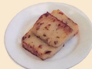
PAN FRIED TURNIP CAKE 素蘿白糕