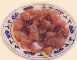
KONJAC 素牛筋 (蒟蒻)