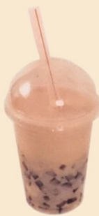
SOYMILK + GRASS JELLY + SOY PUDDING 涼粉豆花豆漿

Made fresh daily, enjoy it plain or a mix with our toppings