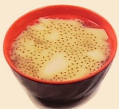
BASIL SEED 青蛙蛋豆腐花