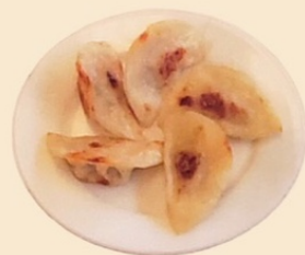
POT STICKERS 香煎菜肉餃子