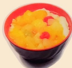
MIXED FRUIT + EVAPORATED MILK 雜果花奶豆腐花