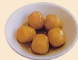
CURRY FISH BALL 咖喱魚蛋