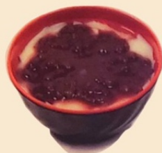
RED BEAN 紅豆豆腐花