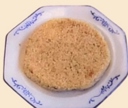
RED BEAN SESAME PASTRY 豆沙餅