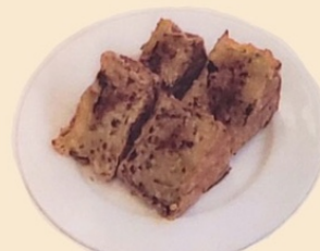
PAN FRIED TOFU 煎釀豆腐