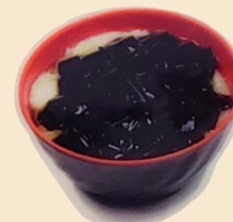
GRASS JELLY 涼粉豆腐花