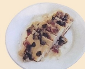
SOFT TOFU w/ AGED EGG & MUSTARD STEM 涼拌豆腐