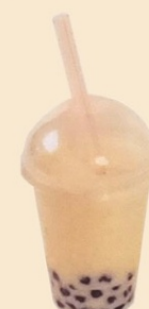
SOYMILK + PEARLS 波霸豆漿