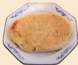
TARO SESAME PASTRY 香煎芝麻芋頭