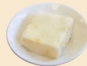
SPLITBEAN CAKE 馬豆糕